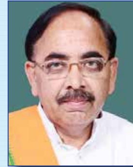
Dr. Mahendra Nath Pandey Hon'ble Minister of State for HRD (Higher Education)