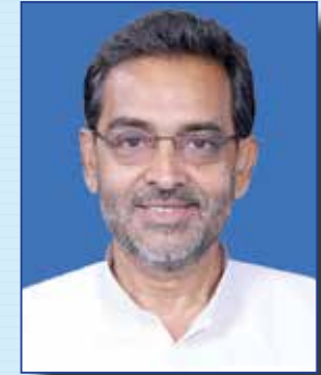
Shri Upendra Kushwaha Hon'ble Minister of State for HRD (School Education & Literacy)