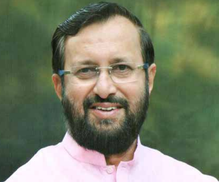
Shri Prakash Javadekar Minister of Human Resource Development Government of India