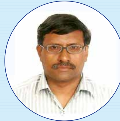
Additional Secretary Technical Education

It is an honor for me to congratulate all graduating students for their outstanding achievement! This is an important moment in your life but there is lot more to come in way in form of goals, challenges and opportunities. Anything is possible when you must believe is yourself. It's chance to spread your wings to fly high and rise personal and professional life.