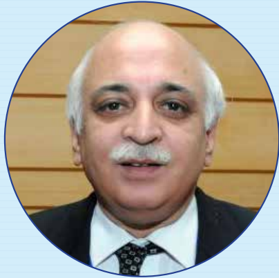
Secretary Technical Education

Convocation is the symbol of celebration of graduates' four years of victory in education. The power of education can't be measured unless, you count its potential to create a career, a life and pave the way for a better tomorrow of nation. I congratulate all B.Tech and M.Tech Students who won the battle and are today graduated from the Institute. It is my privilege to share best wishes and love with students and their parents on this auspicious day of 1st Convocation of NIT Delhi. Life is principle and right choices backed with old hard work plans a start of earning, I urge you all that never stop learning to have wonderful achievement waiting a head in life.